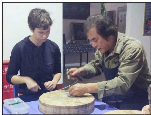
She made Chinese traditional iron art with the artist.

Despite the hard work of learning Chinese and adapting to a different country, I am having a great time. I will be in China for another five months, but I hope that this stay will not be my last in China.